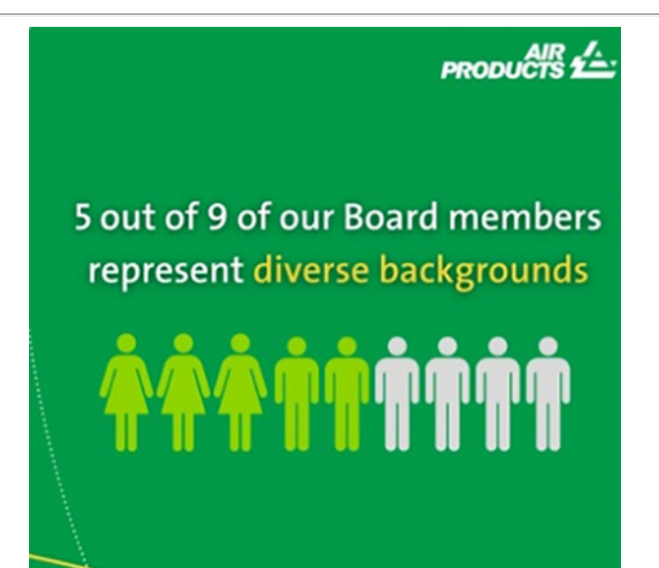
5 of 9 Members represent diverse backgrounds